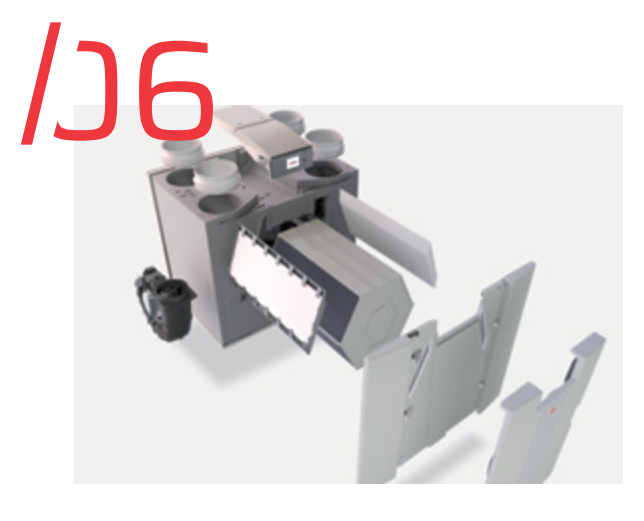
*not for CWL 2-225/325/400

The CWL-2 is also optionally available with a moisture-recovery heat exchanger.* Thanks to the antibacterial polymer electrolyte membrane (PEM), no odours or pollutants are released into the supply air - for optimum hygiene and comfort. A separate drain connection is no longer required.